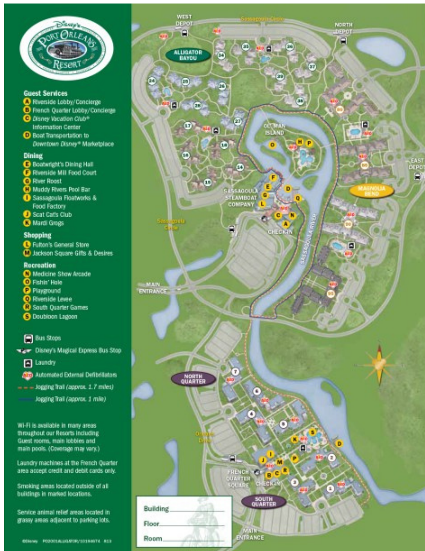
Port Orleans Riverside & French Quarter Resort Map

These resorts do not offer fine/upscale dining restaurants or valet parking. These resorts are large, and there is a (10 minute) walk to access the main pool, food-court/restaurant and front lobby depending on your room location.