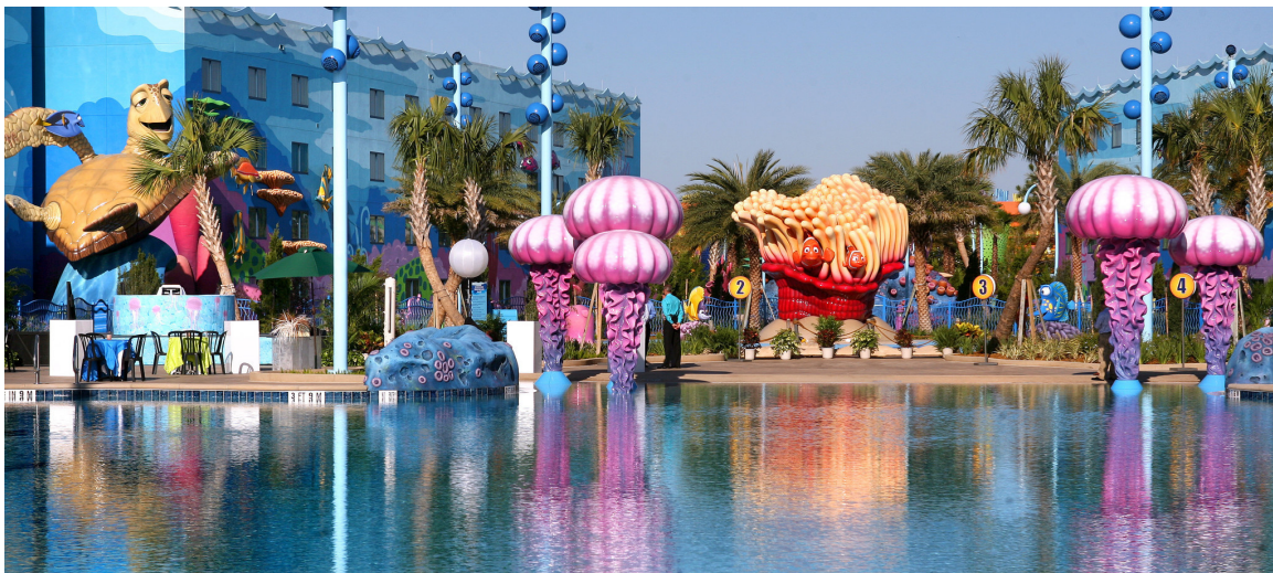
Art of Animation Resort

Art of Animation is considered a "Value Plus" since it offers interior carpeted corridors and a larger & better food court. It also comes with a higher price tag than the other value resorts.