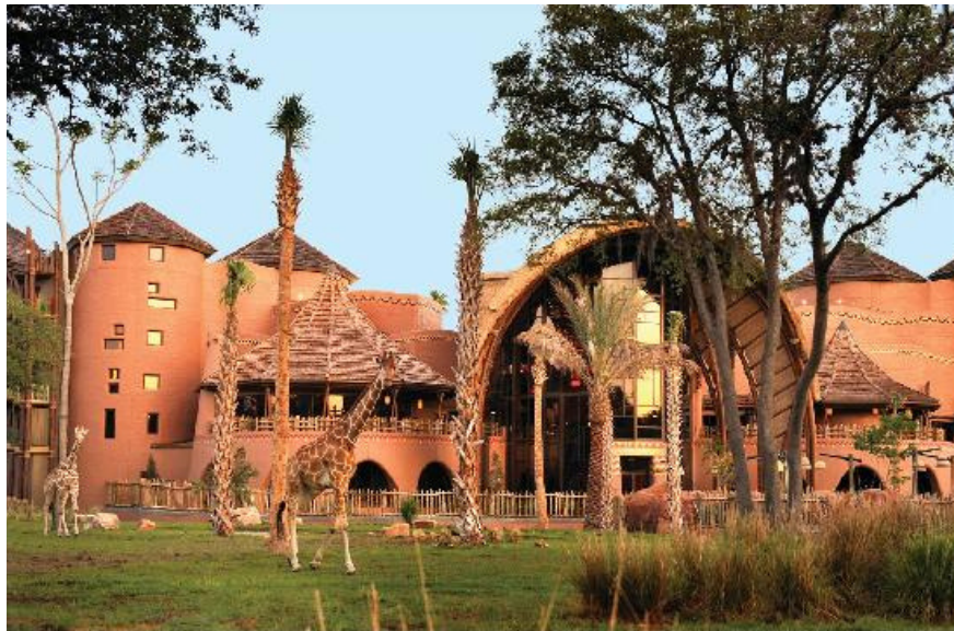
Animal Kingdom Villas - Kidani Village

Only the Deluxe Studios and 1 & 2 Bedroom Villas at Animal Kingdom Villas-Jambo House offer Club Level.