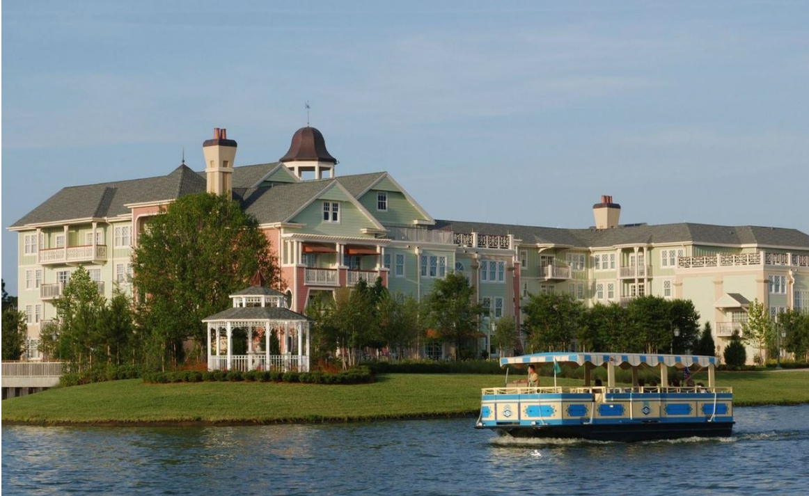
Saratoga Springs Resort

Deluxe Resorts (aka Disney Vacation Club Resorts) are timeshares for Vacation Club members but you can also rent them directly through Disney, the same way you would reserve a hotel. These resorts feature beautiful themes and a variety of at-home accommodations.