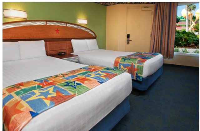
All-Star Music Resort

Preferred Rooms are available - these rooms are situated in close proximity to the lobby, main pool, food court, and bus stop.