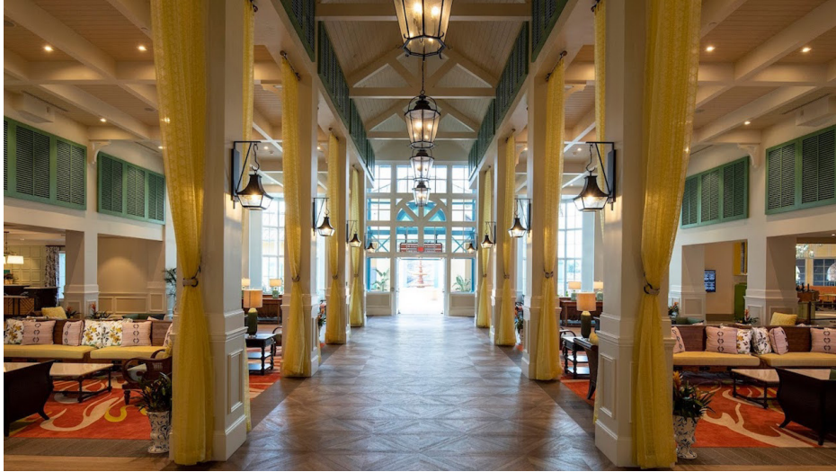
Caribbean Beach Resort

Moderate Resorts are for those who don't mind spending a little more. These resorts offer more amenities than the Value Resorts and feature more extensive themes and lush landscaping.