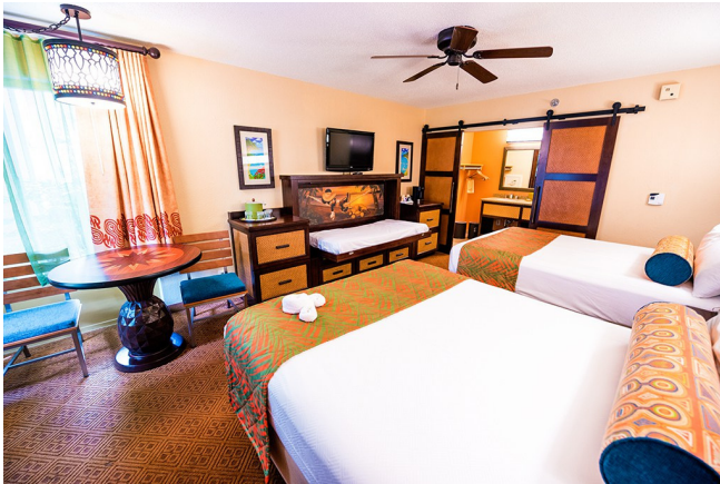
Caribbean Beach Resort – 5th sleeper

*POR and CBR can accommodate a 5th guest with a child-size pull down bed in the room. Both resorts offer themed rooms too.