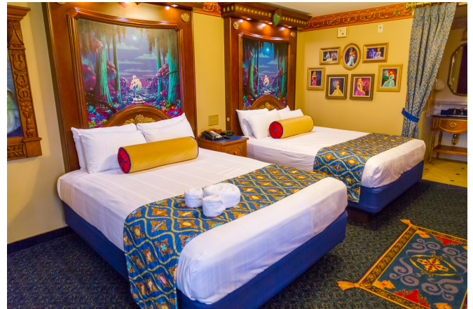
Port Orleans Riverside – Royal Guest Rooms