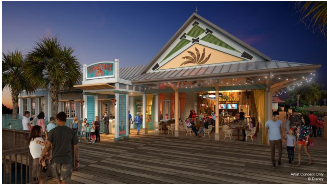
Caribbean Beach Resort

Include a food-court, table-service restaurant (with exception of PO-FQ), lounge and/or pool bar, video game room, self-service laundry facilities, gift shop and on-site recreations. *PO-FQ is on shared property with POR, so you can always take a stroll to enjoy amenities at either resort.