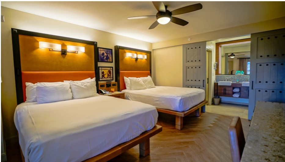
Coronado Springs Resort

Room options are one King or two Queen beds with complimentary Wi-Fi, and a mini-fridge. All rooms have exterior exits. You have your choice of views - courtyard, pool, lake/river, garden, woodlands or parking area.