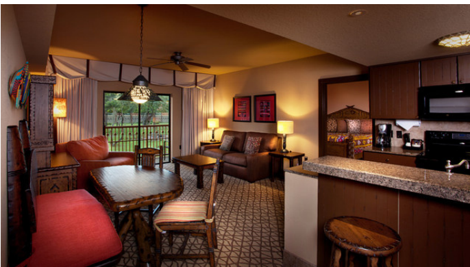
Animal Kingdom Villas-Kidani Village - 2 BR Suite

The room options consist of Deluxe Studios and 1, 2, & 3- Bedroom Villas. The studios include a mini-fridge and microwave and can accommodate either 4 or 5 guests. The 1, 2, and 3-Bedroom villas include a full kitchen and living room in addition to the bedroom. They also have a washer & dryer within the unit.