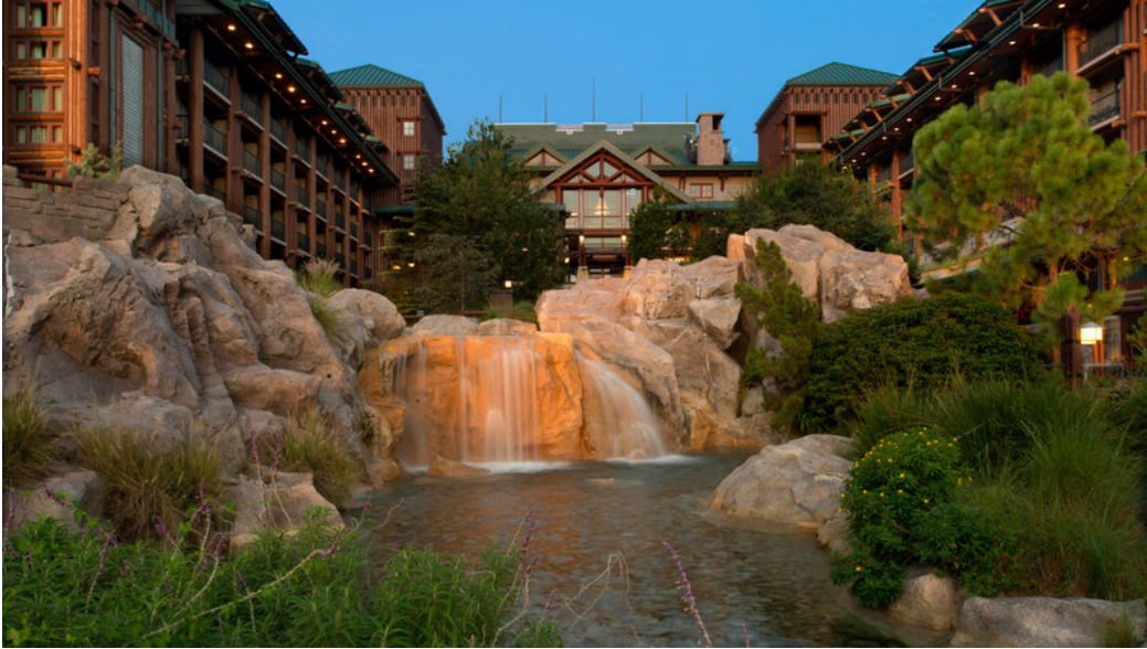
Wilderness Lodge Resort

Deluxe Resorts feature the most unique and elaborate themes with visually exceptional architecture and spectacular lobbies. They also come with a higher price tag. The Deluxe resorts offer a large array of amenities and services.