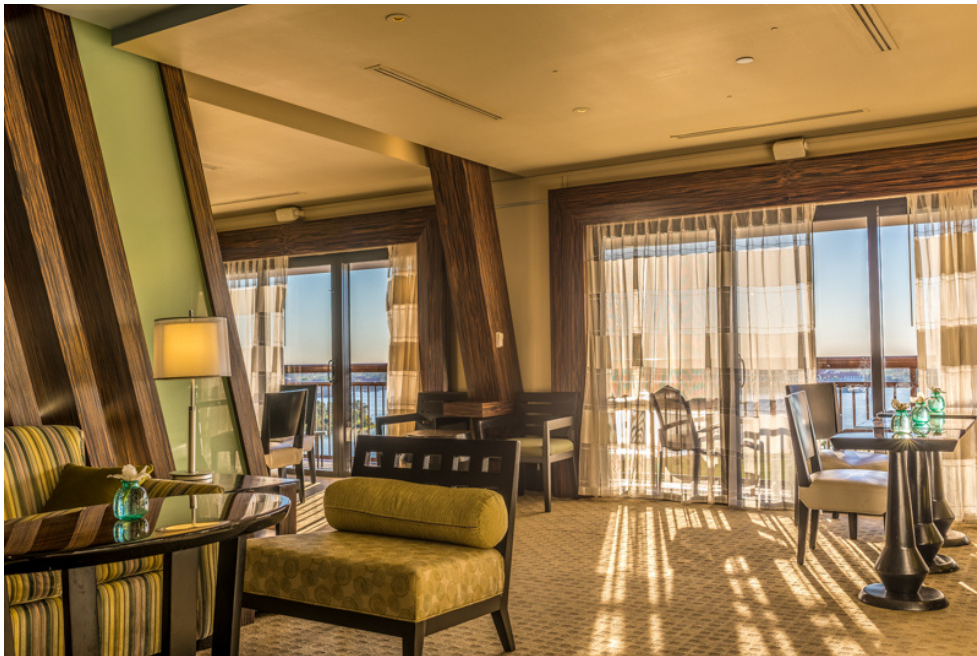
Club Level Lounge at Contemporary Resort

The Deluxe resorts also offer a special category of rooms that come with a variety of additional amenities unique only to Club Level. These services include evening turndown and a secured key access to the club-level lounge which serves refreshments 7:00am to 10:00pm daily with complimentary continental breakfast, snacks in the afternoon, cold appetizers & desserts along with beer, wine, and cocktails in the evening. There is access to concierge service, health club, and personalized front desk and guest services. Club Level guests also have a separate check-in area & advanced itinerary planning.