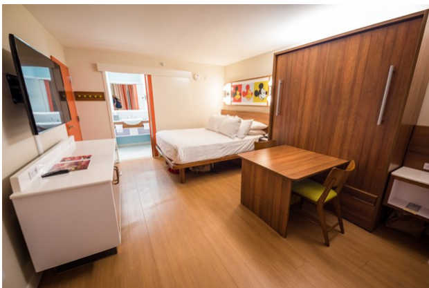
Pop Century Resort

Room options are one King or two Double beds with complimentary Wi-Fi, and a mini-fridge. Family Suites include a combination featuring a Queen size bed. ( *Exception - Pop Century & All-Star Movies has Queen beds now! ) You also have your choice of views - courtyard, pool, or parking area.