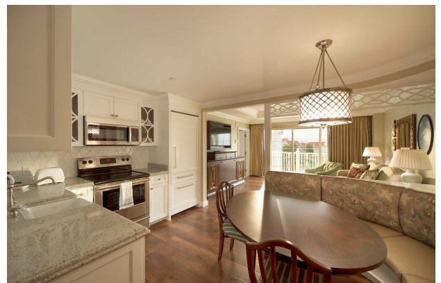
The Villas at Grand Floridian