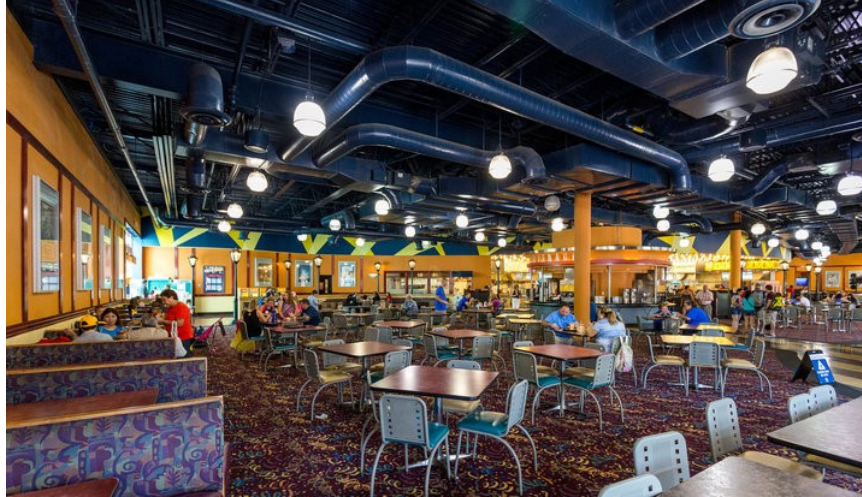
All-Star Movies Food Court

Basic amenities such as a food court, pool(s), self-service laundry facilities, and gift shops are available. They do not have a table-service restaurant, indoor bar or lounge, gym, or room service (with the exception of pizza delivery).