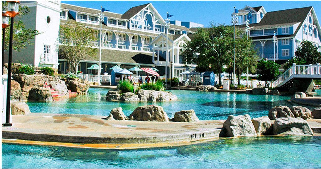
Beach Club Resort

The main pools are dramatically themed and include water slides and hot tubs/spas. These resorts also have a counter-service option, moderately priced table-service restaurant, a fine dining/upscale restaurant, along with room service, lounge bar and a pool bar. They also offer high-end gift shops, kids club & baby-sitting, a video game room, health club, on-site recreation, valet parking, and some even have a salon.