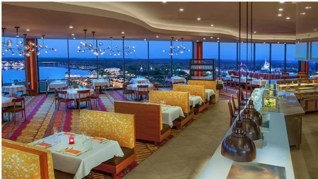
California Grill at Contemporary Resort