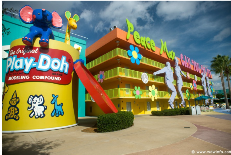
Pop Century Resort

Value Resorts are the most economical. They feature huge themed icons, and are bright and colorful. They have motel-style exterior corridors, with partial exception of Art of Animation.